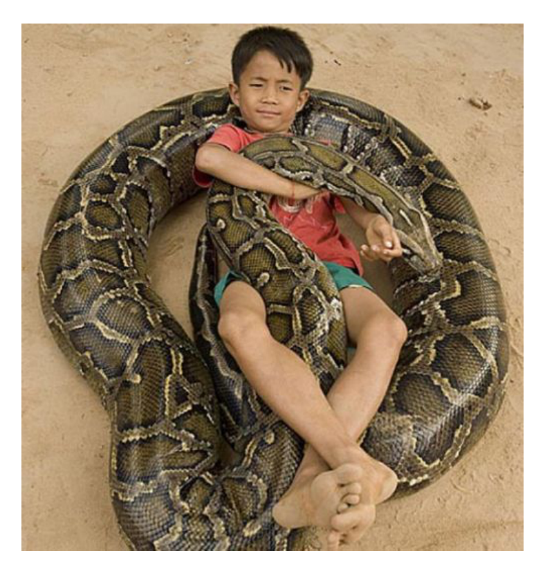
The boy from Thailand, who was brought up with a snake.