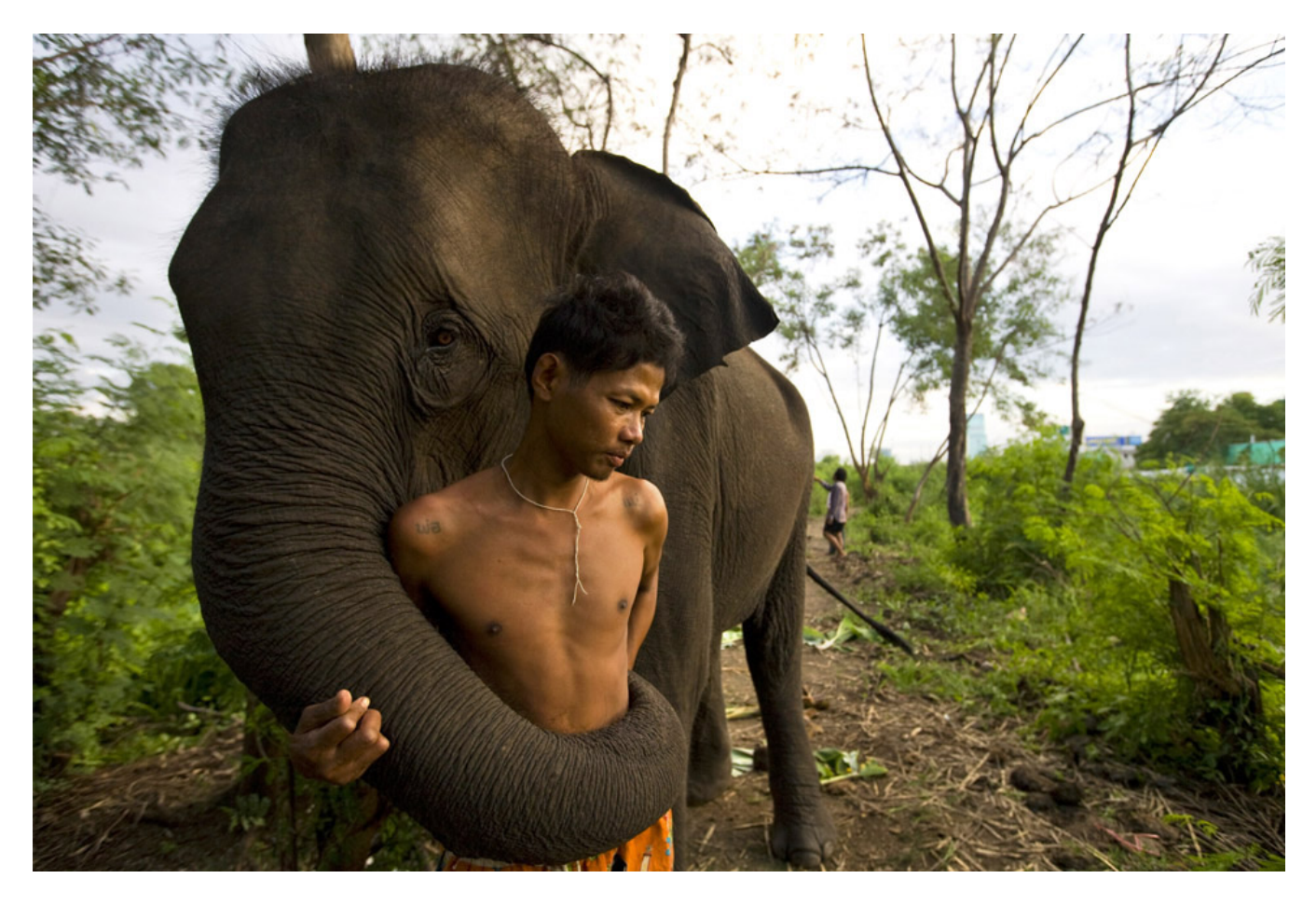
The work arrangement probably works, but perhaps there is trust and affection? New creation?